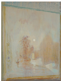
Barry McGlashan, Gold Creek , 2024, Oil on canvas, 16 ⅛ x 12 ¼ inches