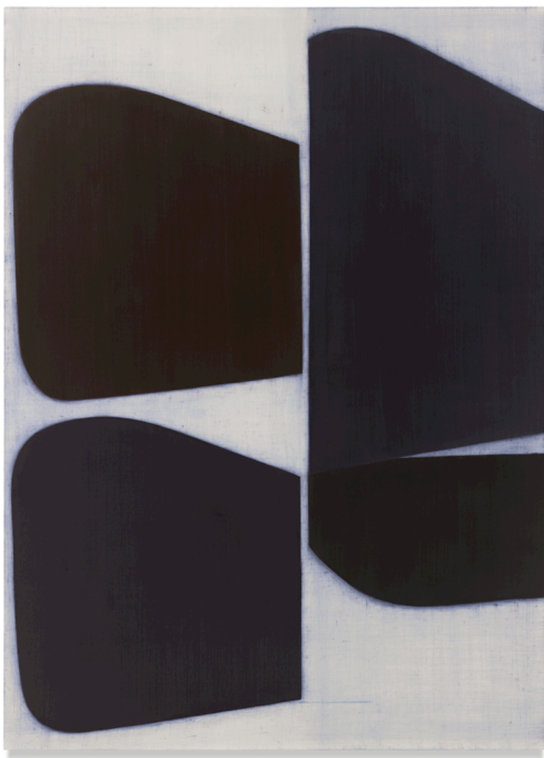
Suzanne Caporael 747 (blue, 3), 2018 Oil on linen 66 x 48 in. (13)