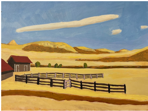
Mike Piggott, Untitled , 2024, Oil on canvas, 12 x 16 inches