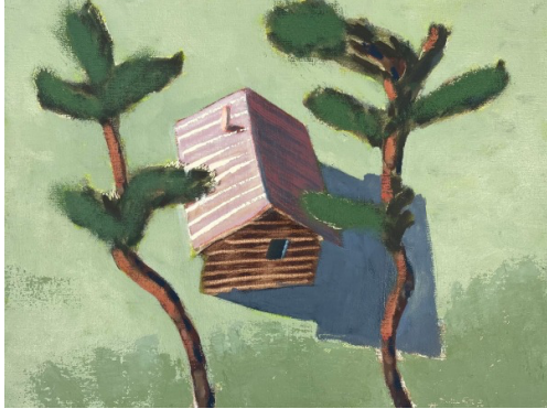
Mike Piggott, Silhouettes and Shadows , 2024, Oil on canvas, 12 x 16 inches