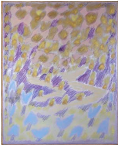
Larissa Lockshin, Untitled (Iridium) , 2024, oil and soft pastel on dyed satin, 30 ½ x 24 ½ inches